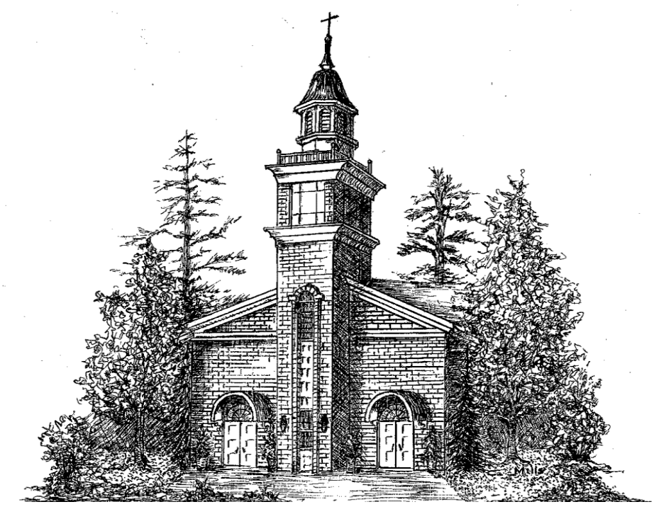
Amity, drawing by Charlie Mills

Amity Presbyterian Church April 25, 2024 at 2:00 p.m.